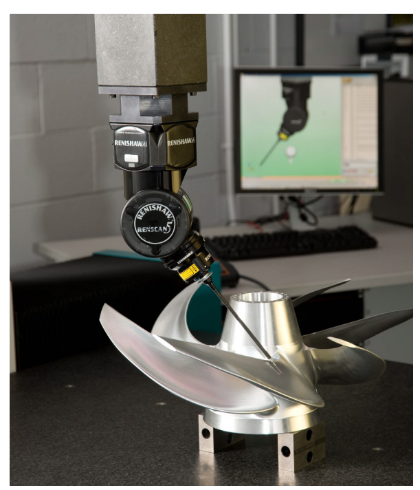
Renscan5 allows TURBOCAM to do continuous, automated measurement of complex turbomachinery components, collecting thousands of points to verify form

Changing 3-D part geometries required many different probe orientations, plus frequent stylus and tip changes for difficult to reach features, explains Dave Romaine, Quality Assurance Manager. "We would have to stop the CMM and calibrate each re-orientation of the probe. That was compounded as we inspected multiple blades around a part."