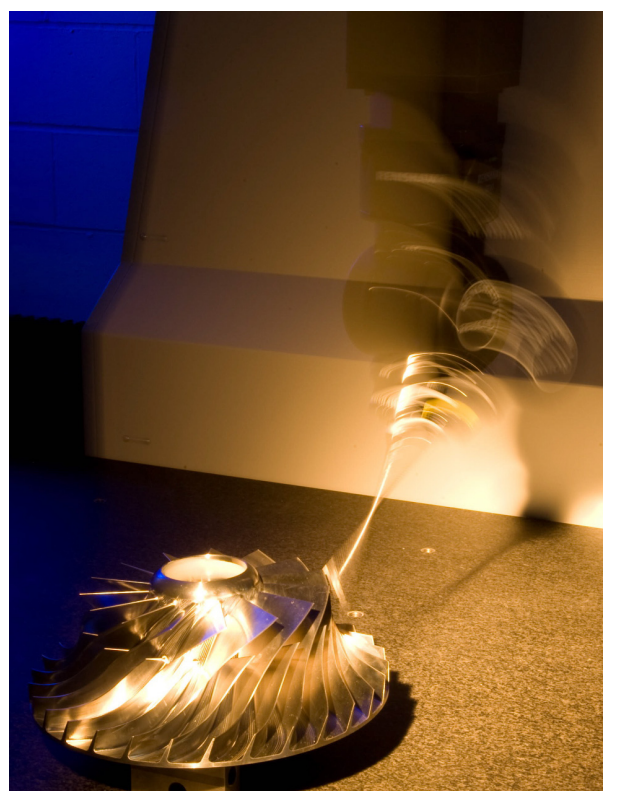
Unique laser correction allows Renscan5 to measure parts at ultra-high-speeds and acc/dec

Renscan5 allows the CMM's three-axis platform to be used primarily to "rapid" the REVO head into position for measurement. Where CMM motion is required for a measurement routine, it can usually be limited to a single linear axis and performed at constant velocity, minimizing dynamic effects on accuracy from acc/dec and inertia.