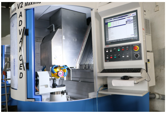
TGT's V2 ADVANCED Maxima tool grinding machine