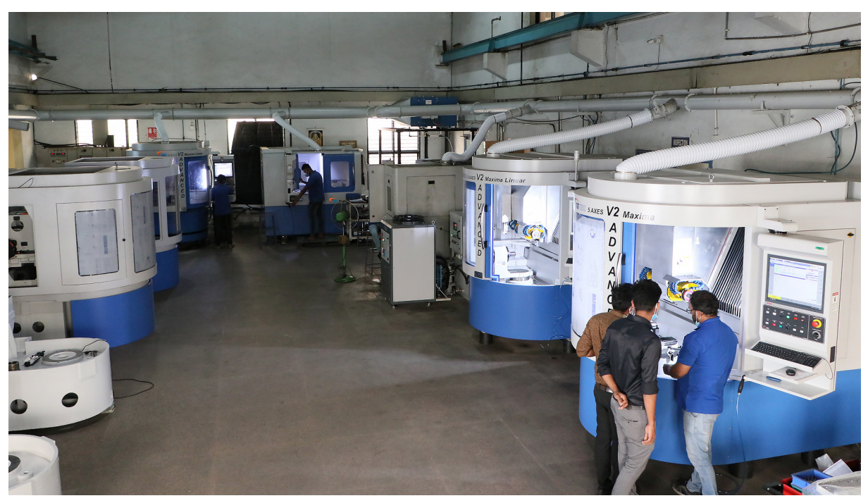
TGT's factory floor in Bengaluru, India