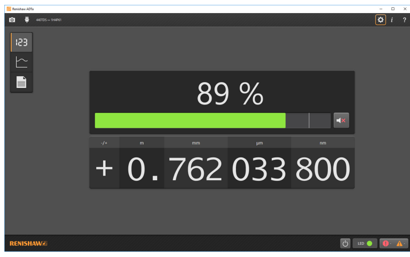
ADT View software interface